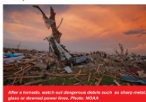
After a tornado, watch out for dangerous debris such as sharp metal, glass or downed power lines.

For more information, visit weather.gov/safety/tornado