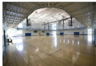
Centennial Commons Gymnasium

Court A - Open Gym Monday - Friday 11:00 a.m. - 6:45 p.m. Saturday 8:00 a.m. - 7:45 p.m. Sunday 12:45 p.m. - 7:45 a.m. Court B - Open Gym (when Programs/Rentals not scheduled)