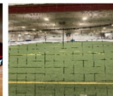
Centennial Commons Indoor Soccer Facility - Open (when Programs/Rentals not scheduled)

Court A Monday - Friday 6:00 a.m. - 11:00 a.m. Sunday 10:30 a.m. - 12:30 p.m. Court B Monday - Friday 5:00 p.m. - 6:45 p.m.