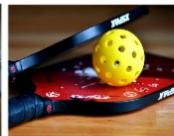
Centennial Commons Gymnasium Pickleball Hours

Court A - Open Gym Monday - Friday 11:00 a.m. - 6:45 p.m. Saturday 8:00 a.m. - 7:45 p.m. Sunday 12:45 p.m. - 7:45 a.m. Court B - Open Gym (when Programs/Rentals not scheduled)