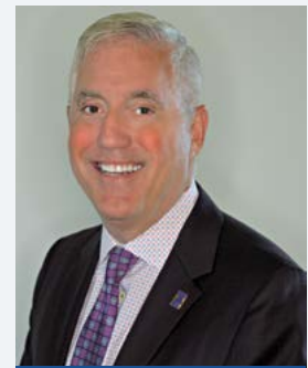
Mayor Terry Crow